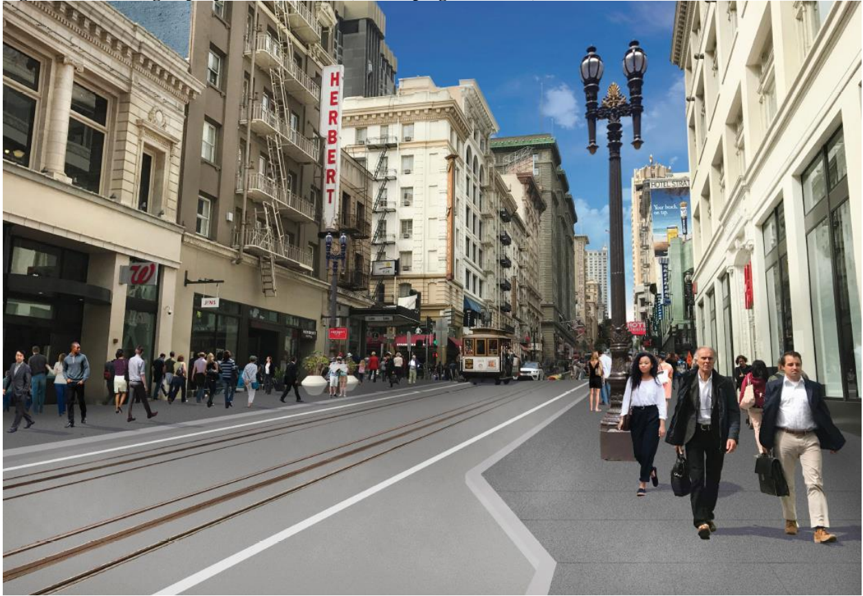
Figure 2: Rendering of proposed conditions (landscaping not shown)