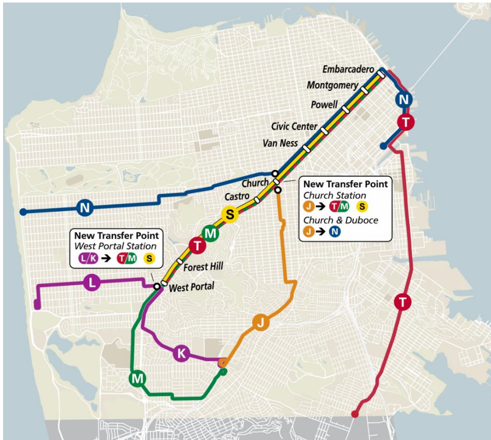
Figure 1: New Temporary Muni Rail Service Plan that was in effect between August 22 nd and August 24 th

with bus substitution. The S Shuttle is not operating.