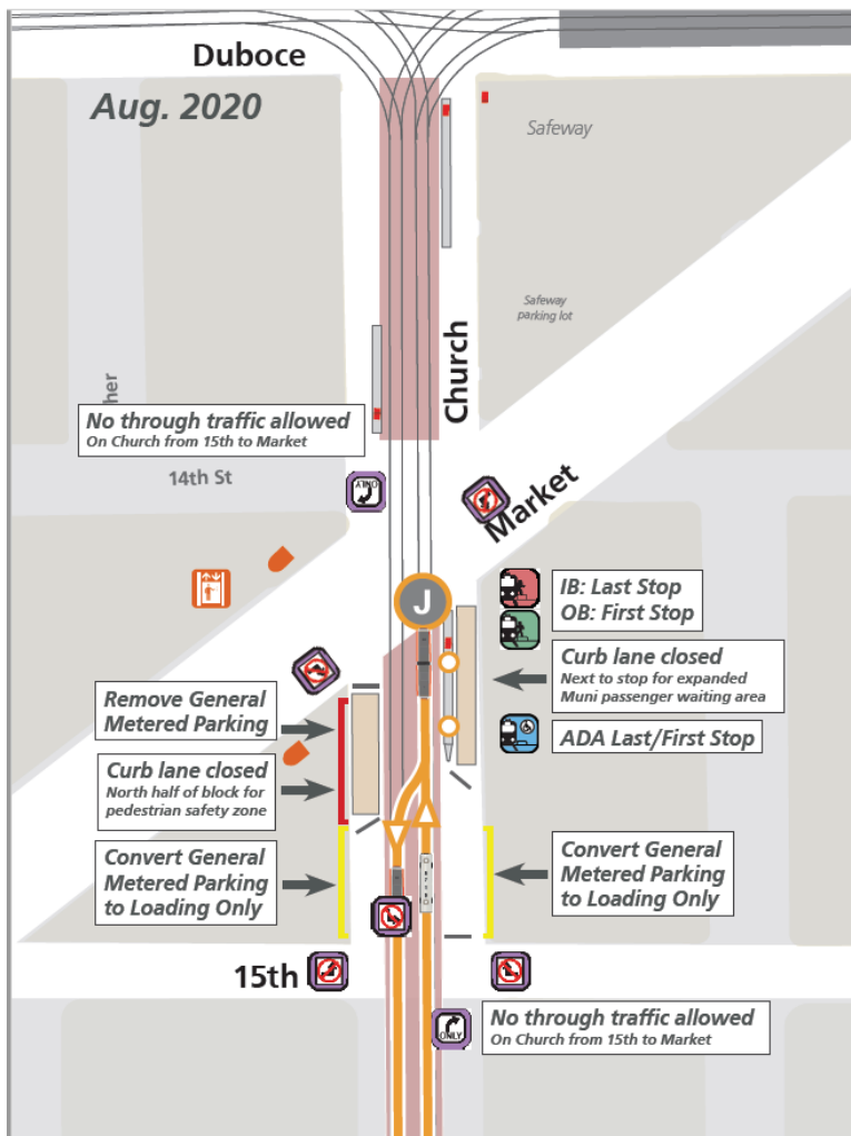
Figure 2. J Church Transfer Improvements Phase 1 (began August 2020; trains currently being substituted by buses)